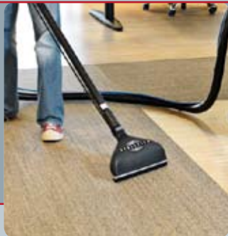
Suitable for both hard and soft floors