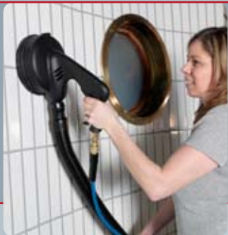
The hand tool can be used in hard to reach areas and on walls