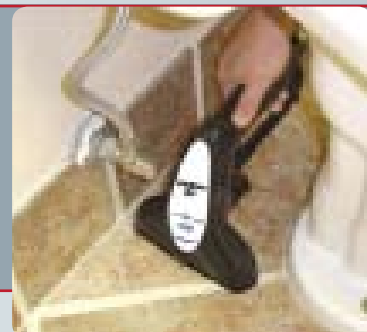
Cobra DT detail tool is ideal for corner and edge cleaning in hard to reach tight spaces