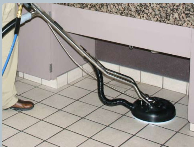
In one cleaning pass of the Turbo wand, this machine cleans, rinses, and extracts water and soil leaving floors clean and nearly dry