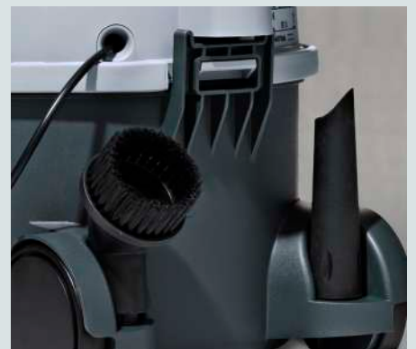
Discreet storage for nozzles allow all the tools you need to be within easy reach at all times