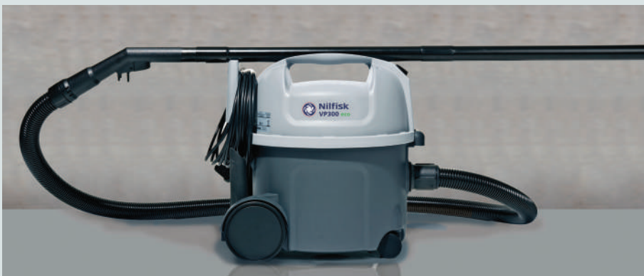
VP300 can be carried safely and comfortably in one hand