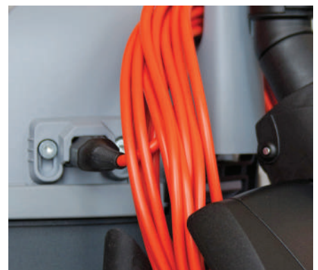
Detachable orange cord (VP300 HEPA)