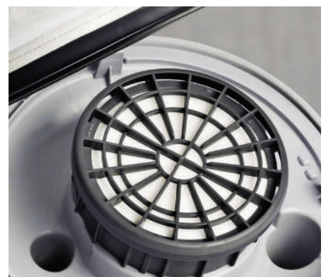
Higher filtration level with HEPA filter (VP300 HEPA)