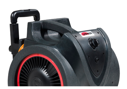
Retractable handle for easy transportation