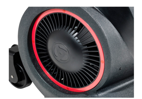
High quality air fan with filter protection