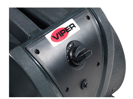
3-speed induction motor with reduced power consumption